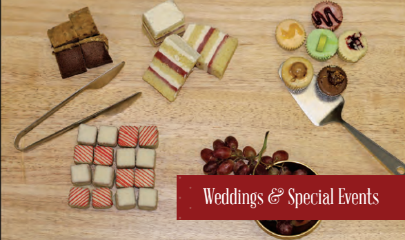
Weddings & Special Events