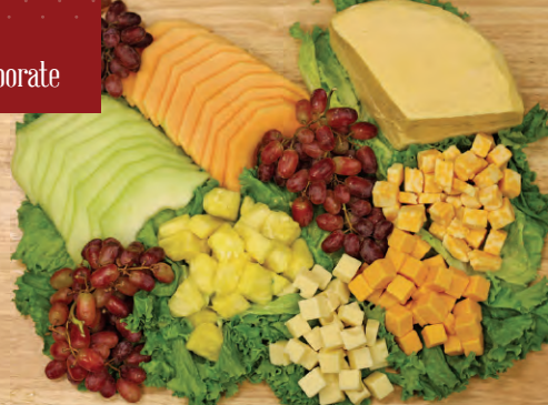
Private & Corporate