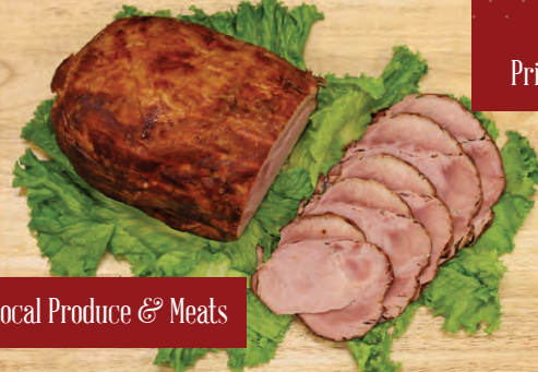
Local Produce & Meats